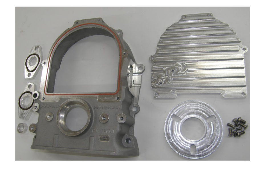
Part Number 14011 showing all parts included with the kit